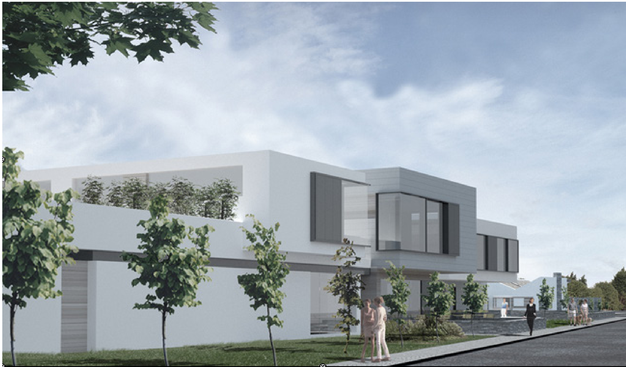
Architects View of new Sports Centre

Planning Permission obtained for 2.8 acres community site to include mixed use Community Centre, Playground and Sheltered Housing.