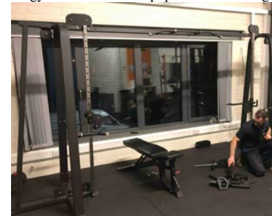
New cable crossover being assembled in KCC Gym

The community gym continues to be one of the success stories of the new Centre and since November 2017 over 400 people have taken out membership of which over 275 are currently active members. The gym continues to be popular across all ages and genders, with a constant flow of users from early morning till late at night. Improvements and additions to the gym continue to be made based on feedback from members and from the gym sub-committee. These include the addition of a commercial cable crossover machine and commercial spin bike. In addition spin bikes have been purchased jointly with one of the personal trainers and spinning classes are now available. As well as the KBCDA committee members, Jenny Connor, Keith Boland and Ross O' Loughlin as regular gym users have been co-opted onto the sub-committee and provide valuable insights and assistance which is much appreciated.