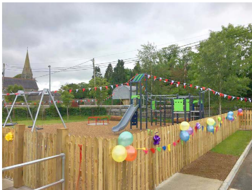
Report on the activities of the Community Development Association

KILANERIN-BALLYFAD COMMUNITY DEVELOPMENT ASSOCIATION