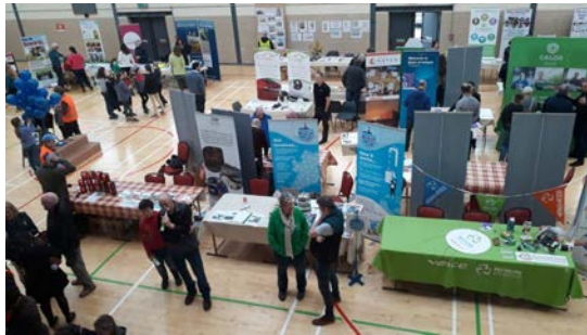
Sustainability Fair, Kilanerin

AWARENESS RAISING has also been high on the agenda, with the following highlights: